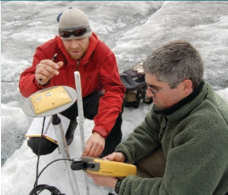
Changes in glacier thickness are measured using GPS equipment.