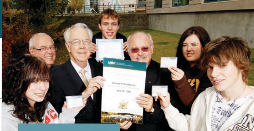
Sharing a birthday with UNBC.

President's Message: www.unbc.ca/president